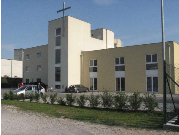
Evangelikale Freikirchliche Gemeinde (Evangelical Free Church Congregation) Mödling, Austria

Although my heart went out to the people who are seeking refuge in Austria it still beats for the people who are indigenous to it. I am convinced that God will use me and my family to share with those who are born and live in the country.