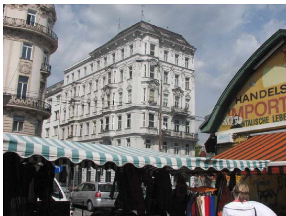
Apartment building near the center market in Vienna

Of course my highlight of going to Europe is my time spent in the country of Austria. I am always taken aback when I go here because of the unbelievable beauty that makes up this country. I cannot understand how, with such great landscaping and unique architectural integrity, these people cannot contain God in their thoughts. It is so spiritually dark. In an interview with the Greater European Missions one man said, “Jesus? Oh he was a man living 2000 years ago, but they murdered him..too bad for him”. This is the attitude of the Austrians. They will give a child a Bible when they enter school, only to inoculate them from Christianity. By the age of 13 most children will have learned to mock Christ.