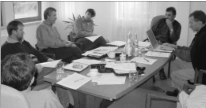
Kontaktmission leadership gathers to discuss the difficult and slow growth of missions activities in Europe.