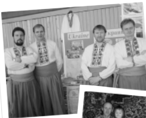
Ukrainian church planting team (top) and Orenburg, Russia church planting team (bottom)