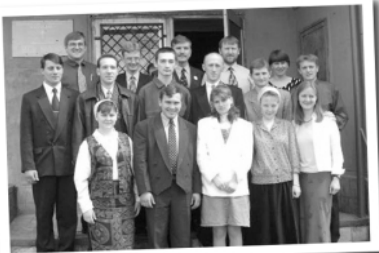
Orenburg students: future church planters

Here's the point: Placing even a small amount of a US church's resources behind such a church planter gives him enough to work with, plus the encouragement to keep going and a relationship with a US congregation that his congregation can enjoy for years. In return, the US church has not only the greatly satisfying experience of a relationship with a foreign church, but also the joy of knowing they are involved in the most efficient form of missions conceivable. If the US's church leadership so chooses, they can participate fully in advising and communicating with the new church. The US congregation can swap gifts and visits with members in the new church. These things must be