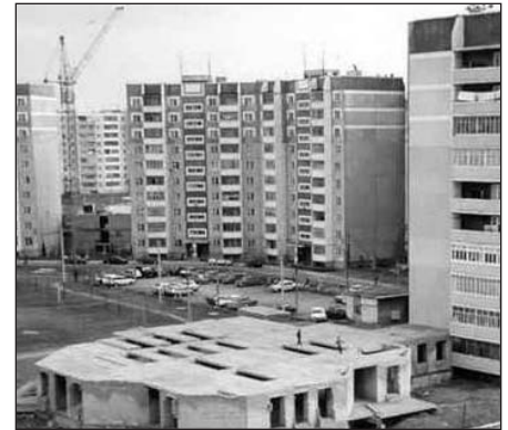
Block housing in Orenburg

About Orenburg... There are about 2.2 million people in Orenburg region, which is located at the southern end of the Ural mountains in west-central Russia. Around 600,000 live in the capital city, also called Orenburg. When Kontaktmission made its initial contacts, there were a total of only 1000 Christians in the entire region with around 500 of these in the capital city itself. Some, but far from all, of these Christians were organized into a few small churches, none of which was thriving. Kontaktmission's start-up team held an open meeting for all interested in reaching the region, and well over 100 came. Since then, Kontaktmission has worked with those Christians to strengthen the local church in Orenburg city, to start two new churches in other population centers in the region, and to open a Bible training center.