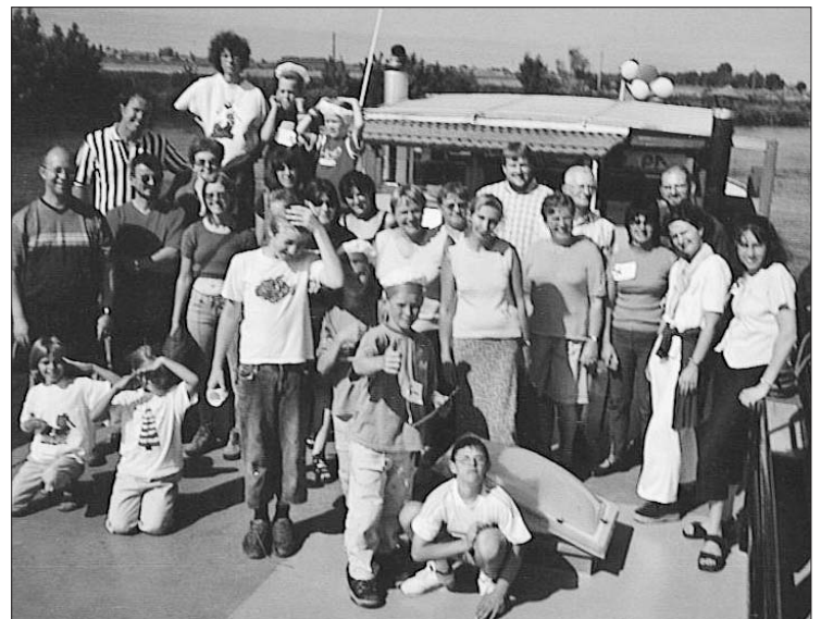
Vacation Bible School included an evangelistic outreach to parents and grandparents.