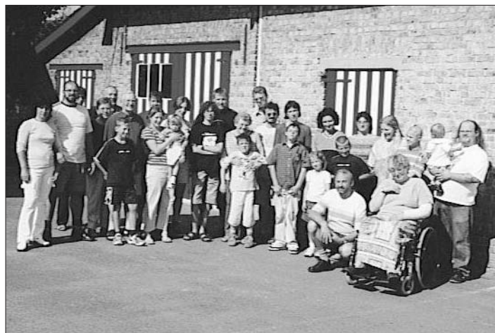
The need is for many more small congregations like this one to be started.

left for neighboring countries, with the result that, even today, Belgium is officially up to 90% Catholic. Until 1962 the Bible was considered a forbidden book for regular citizens, reserved only for the consideration of the Catholic priesthood, and it was not legal to read it. For this reason alone it is not surprising that many Belgians are completely unfamiliar with the Bible. It is simply an alien book to them.