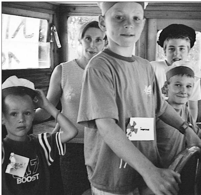
Even in Belgium, kids have a great time at Vacation Bible School.

Brussels, the capital, is the most important city with about 1 million residents. But Brussels is also important for all of Europe and for the world, because it is the home of both NATO and the European Union (EU). Brussels is increasingly at the very heart of political and cultural development in Europe.